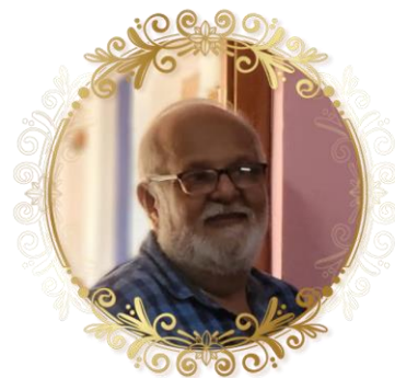
23-October Yugal Sikri